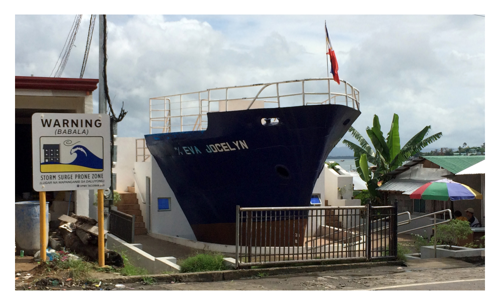
Figure 2. The MV Jocelyn. (figure by author).