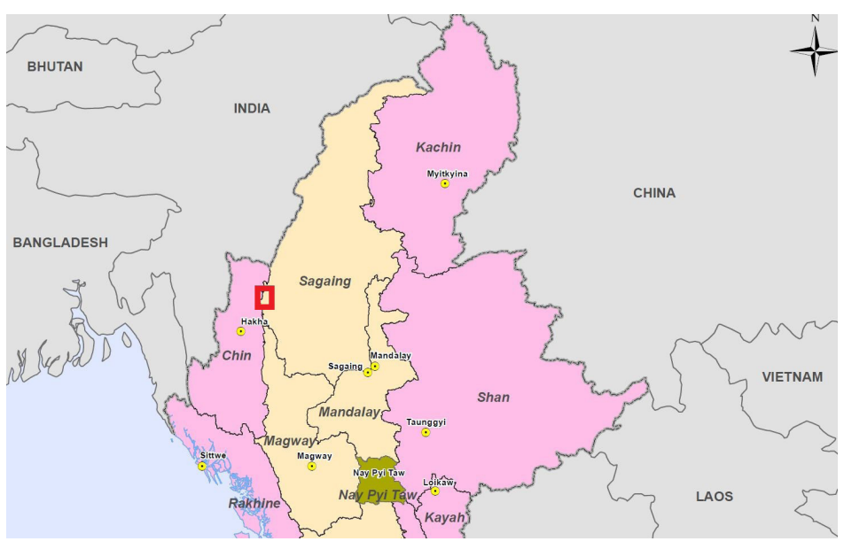
Figure 1. Location of Mwetaung mining project, bordering Chin State and Sagaing Region. (Myanmar Information Management Unit, figure by the author).

through its Bangladesh–China–India–Myanmar Forum for Regional Cooperation (BCIM) Economic Corridor. Unless the central government and investors are prepared to change their approach and renegotiate conditions of integration, including decentralized decision-making and benefit-sharing agreements, politics of dispossession will continue to shape Myanmar's transition.